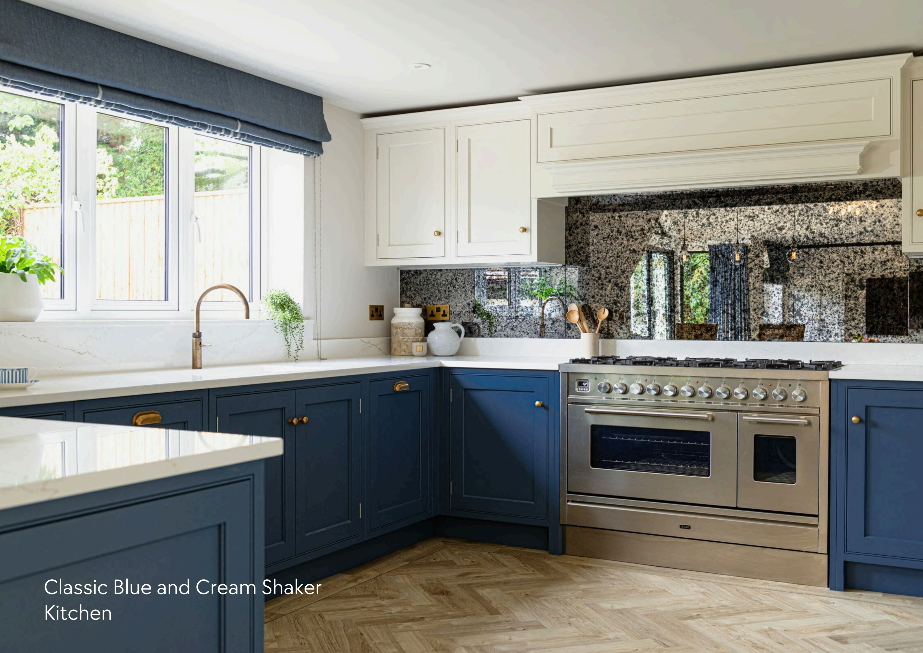
Classic Blue and Cream Shaker Kitchen