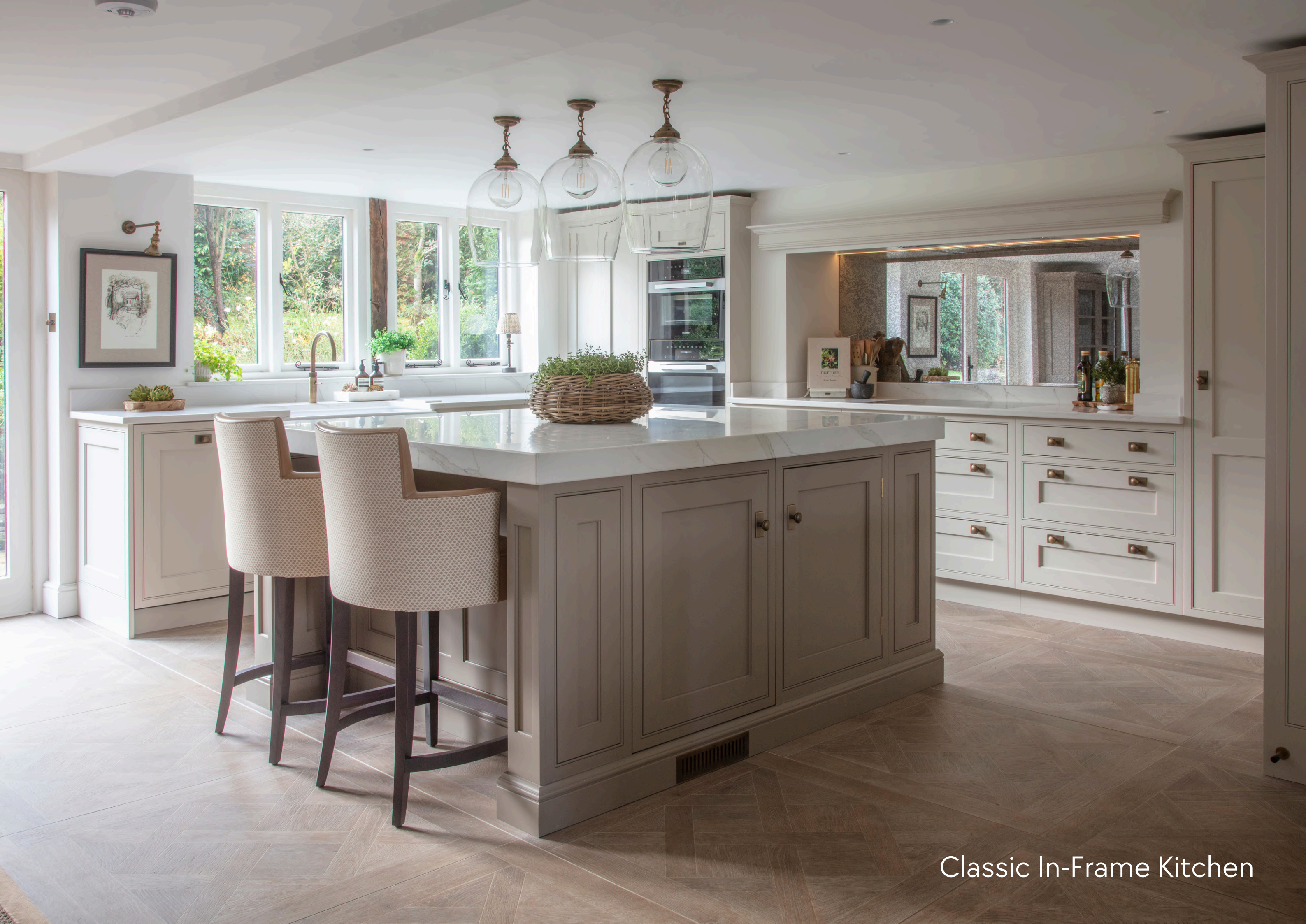
Classic In-Frame Kitchen