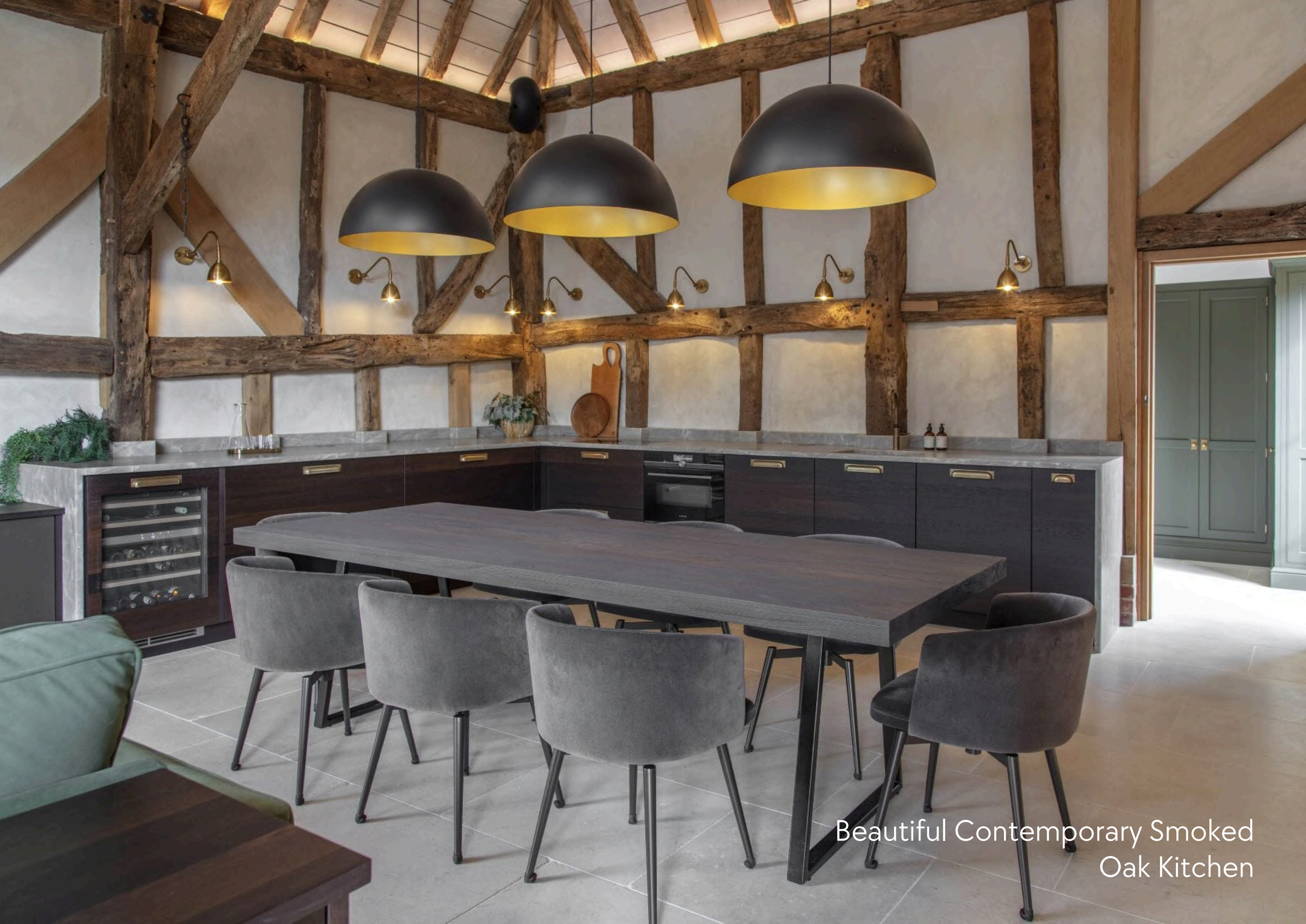
Beautiful Contemporary Smoked Oak Kitchen