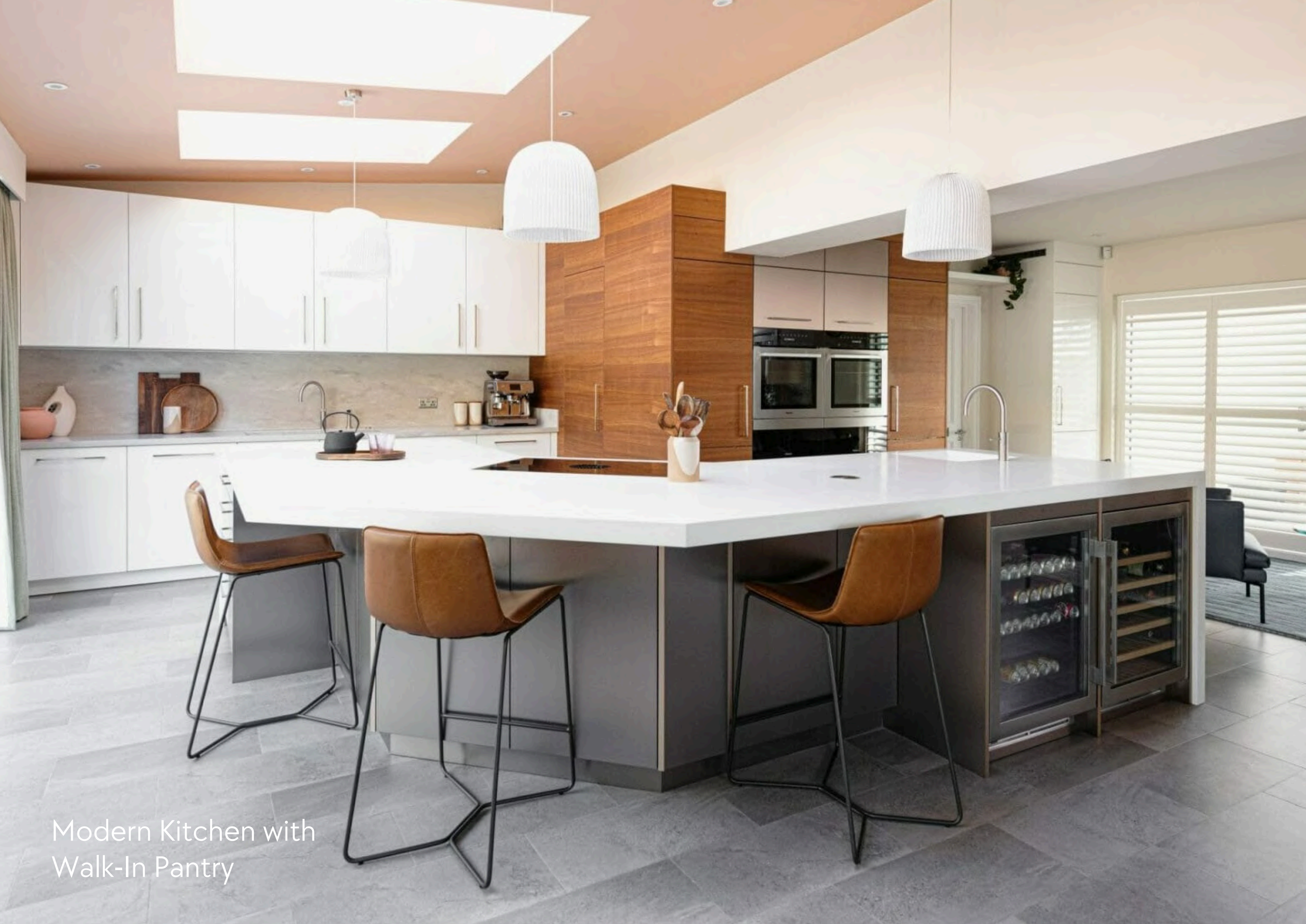
Modern Kitchen with Walk-In Pantry