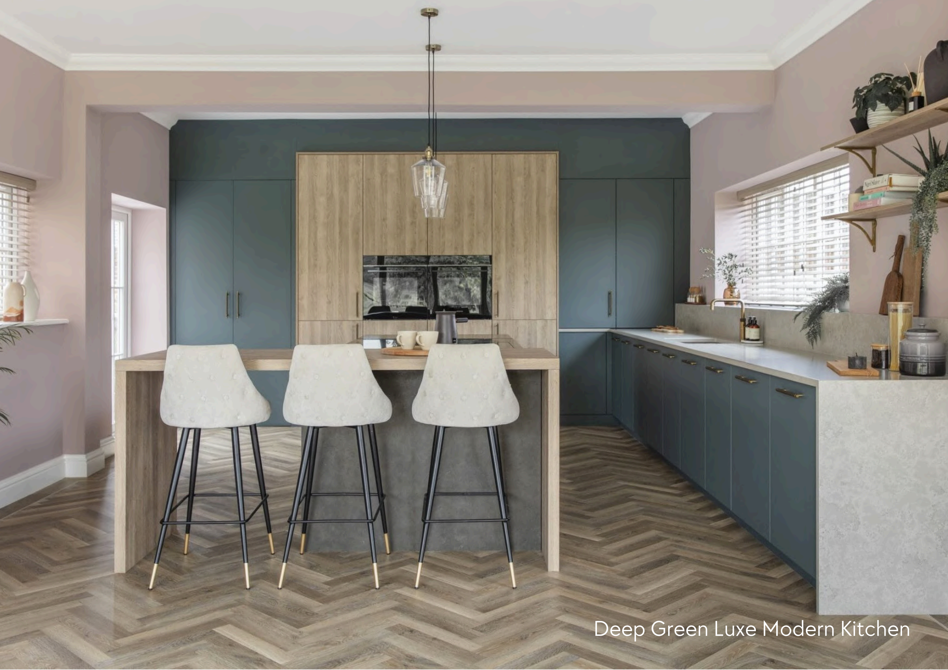
Deep Green Luxe Modern Kitchen