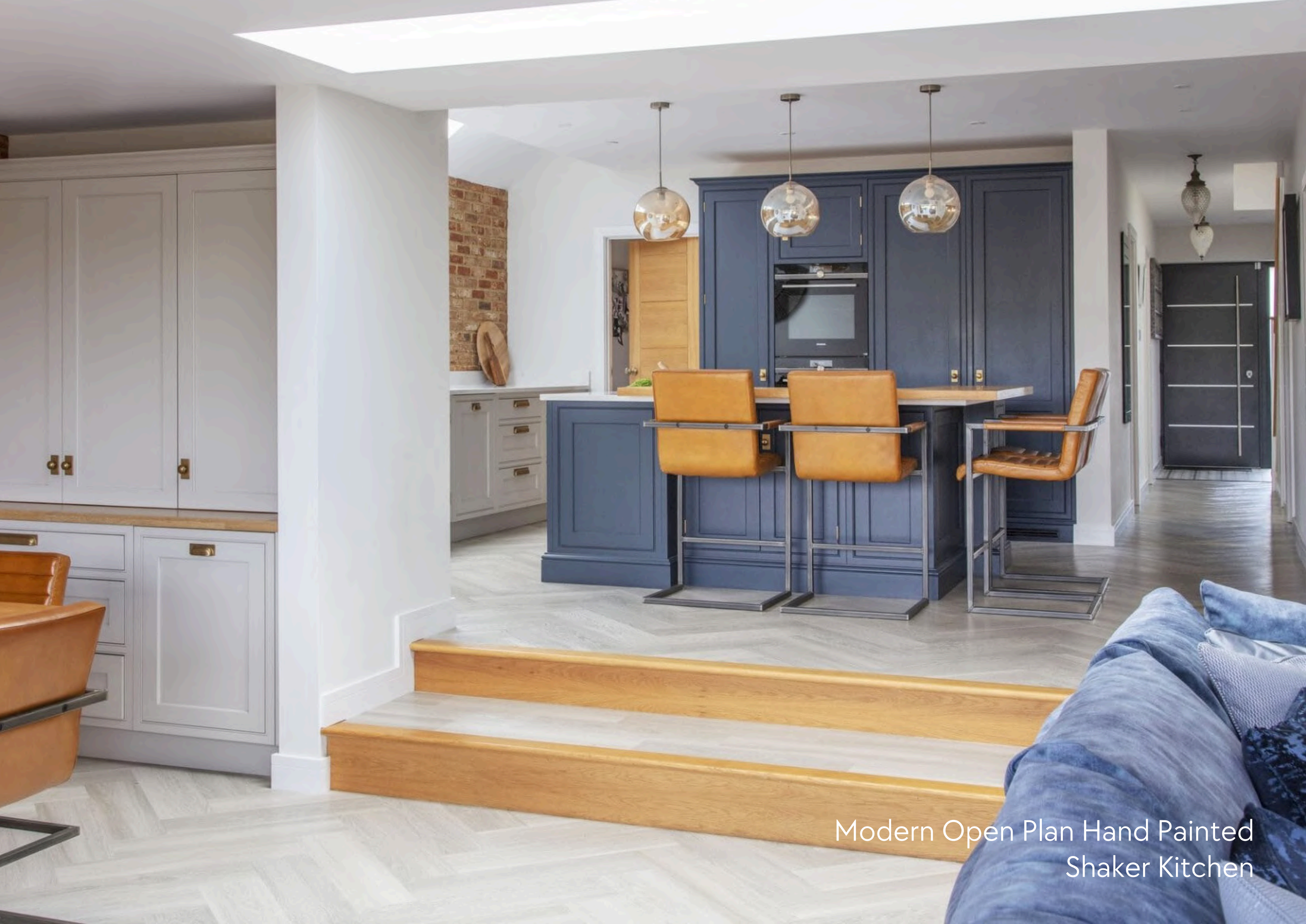
Modern Open Plan Hand Painted Shaker Kitchen