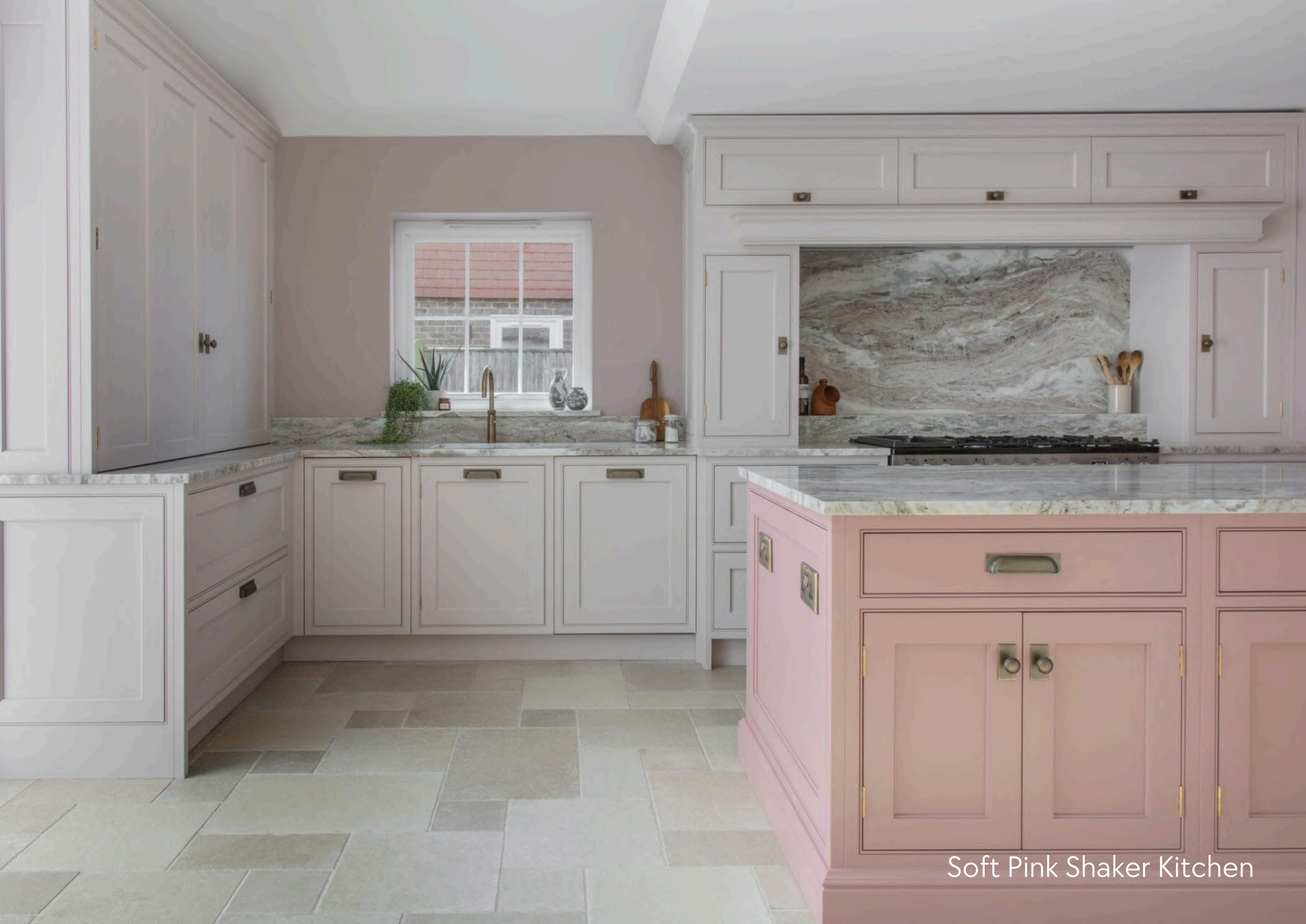
Soft Pink Shaker Kitchen