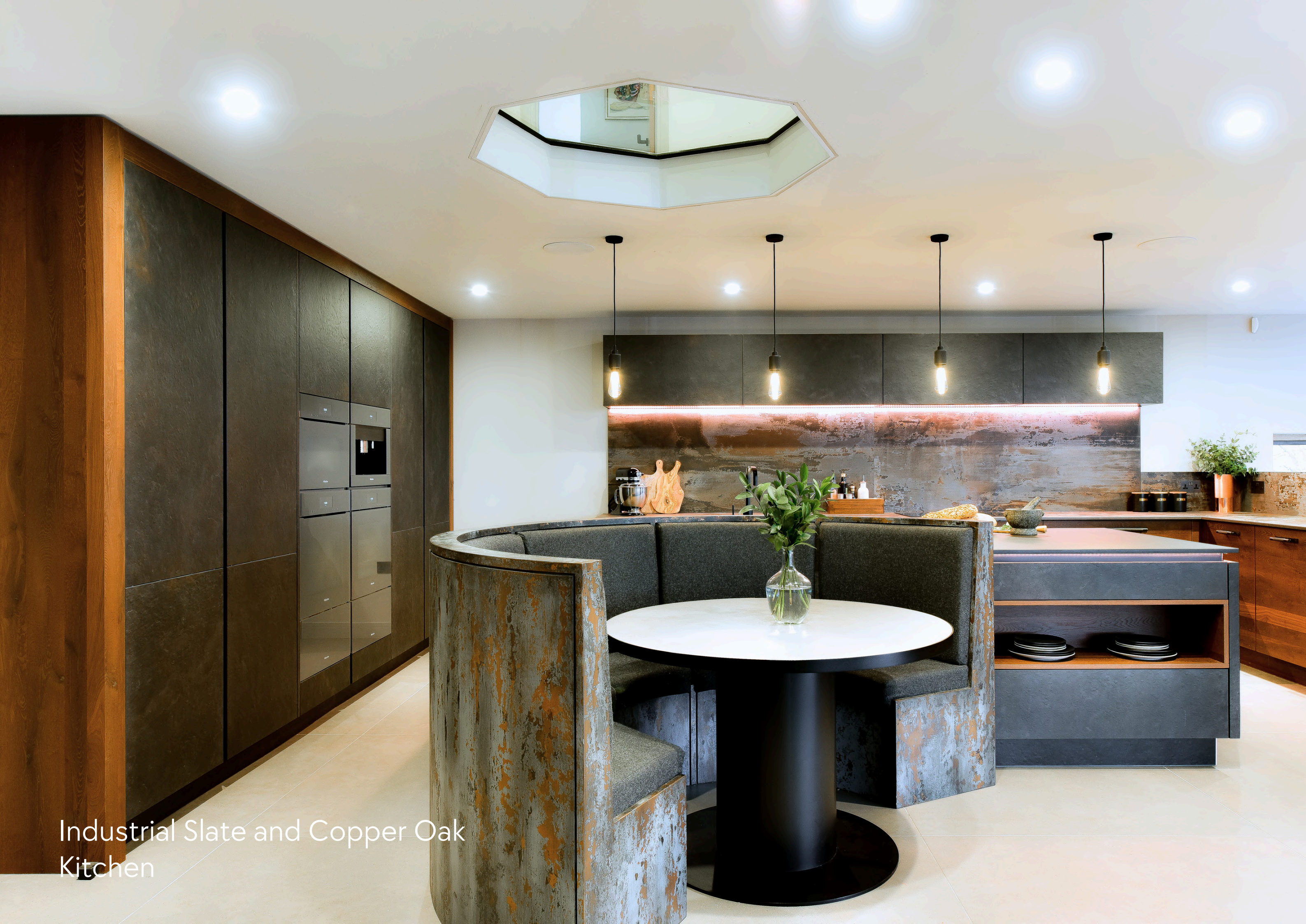
Industrial Slate and Copper Oak Kitchen