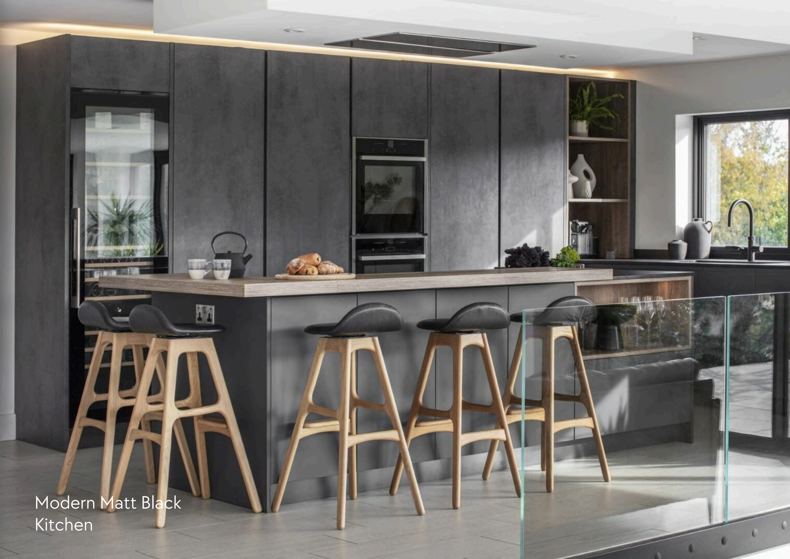
Modern Matt Black Kitchen